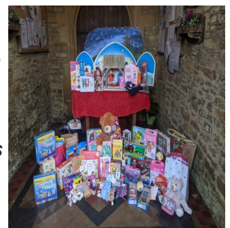
St James' toy collection display & photo by Daisy Boddington, Age 9